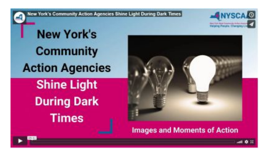
NYSCAA Sponsors a Three Day Training for CAA staff who are interested in becoming an educator/facilitator using ACE Interface Master Trainer Program materials

We have also created a short video showcasing the incredible work that Community Action Agencies in New York have been doing for their communities since the beginning of the COVID-19 pandemic. Please check out the video below!